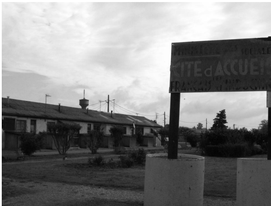
Figure 5: Entrance to the CAFI in 2004. The old sign was resurrected for the 50th anniversary.