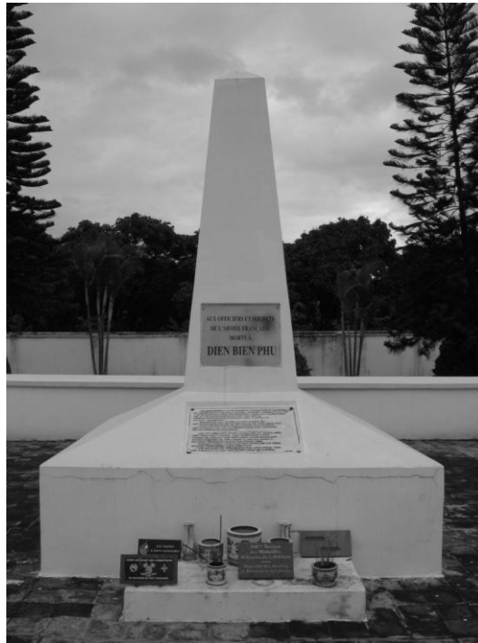
Figure 1: Rolf Rodel's monument at Dien Bien Phu.