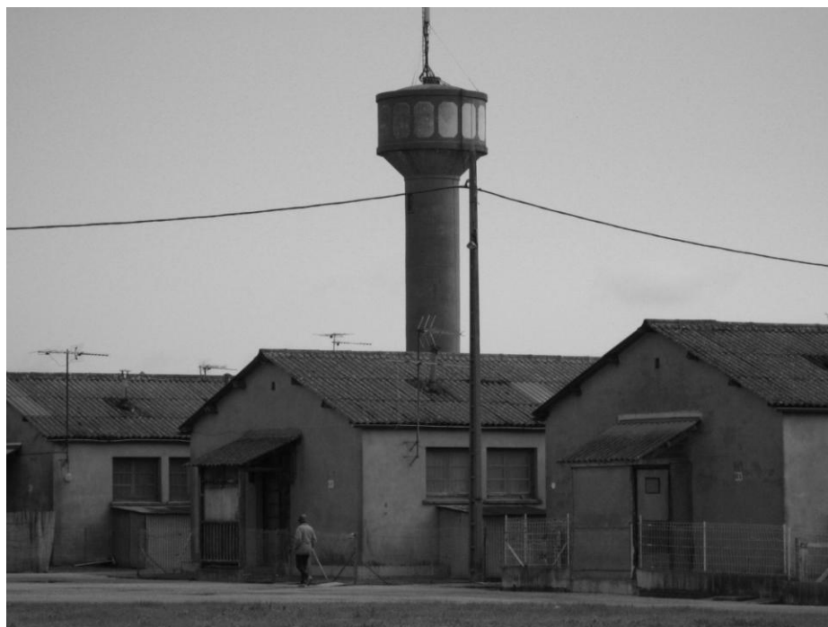
Figure 6: Barracks and the water tower at the CAFI (2004).