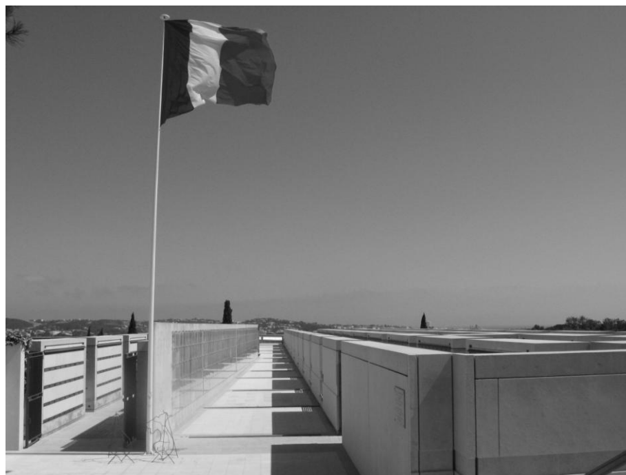
Figure 4: The Memorial to the Indochina Wars, Fréjus.