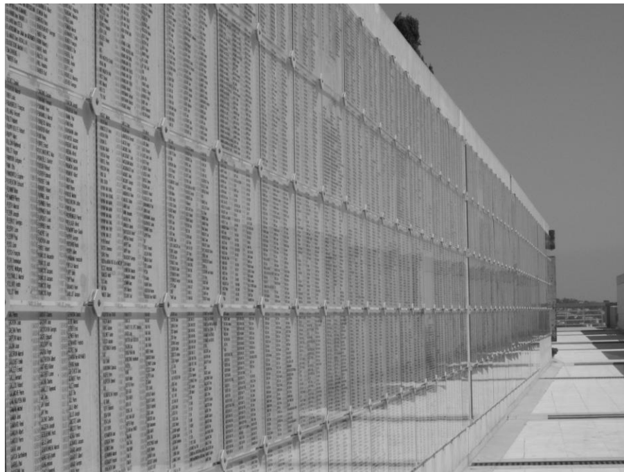
Figure 3: The memorial wall (1996), Fréjus.