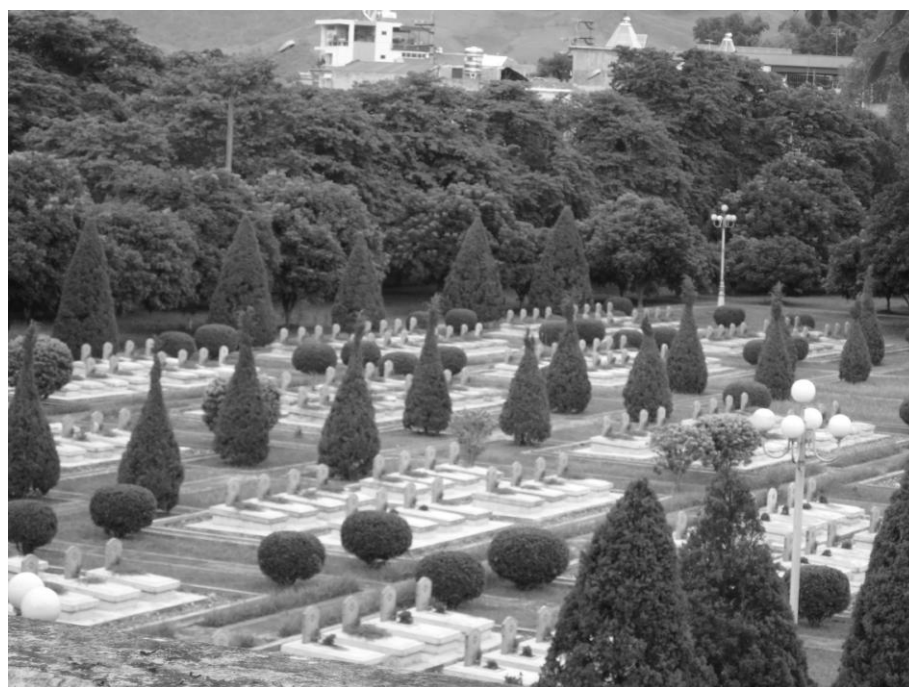
Figure 8: Military cemetery in Dien Bien Phu.