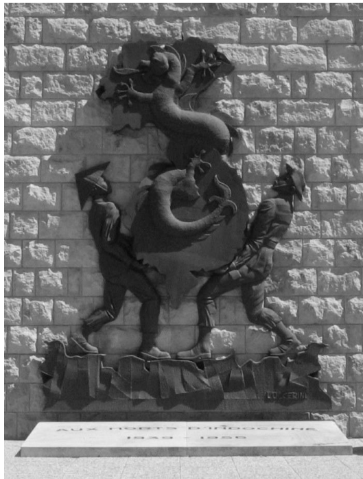
Figure 2: The bas-relief on the Monument to the Dead of Indochina (1983), Fréjus.